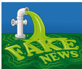
A Parent's Guide to Fake News