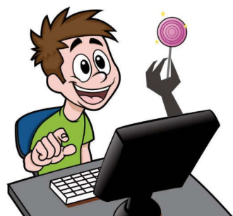
A Parent's Guide to Online Grooming