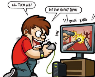
A Parent's Guide to Gaming