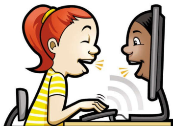
A Parent's Guide to Social Media