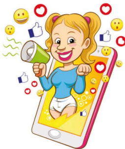
A Parent's Guide to Online Influencers