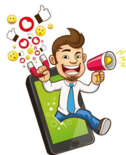
A Parent's Guide to Live Streaming