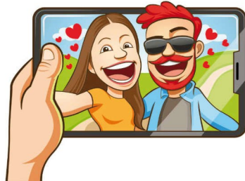
A Parent's Guide to Sharing Pictures