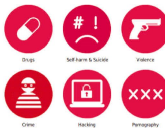
A Parent's Guide to Privacy Settings