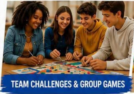
TEAM CHALLENGES & GROUP GAMES