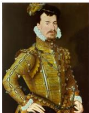
Robert Dudley, Earl of Leicester