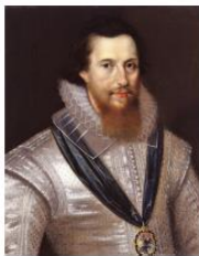
Robert Devereux, Earl of Essex

Instructions: Read through this information sheet about Elizabeth's suitors and complete the activity sheet entitled 'Elizabeth I Suitors Information' and decide who you think would be best suited to marry the Queen.