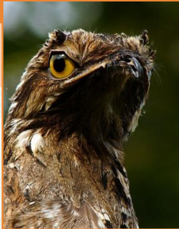
"Mrs. Moon" by julian londono is licensed under CC BY 2.0