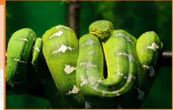
"Emerald Tree Boa" by Eric Kilby is licensed under CC BY 2.0