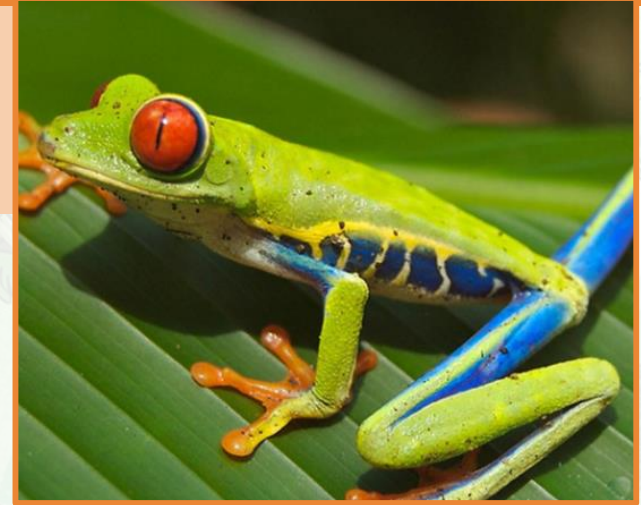
"Red Eyed Tree Frog" by Douglas Tofoli is licensed under CC BY 2.0